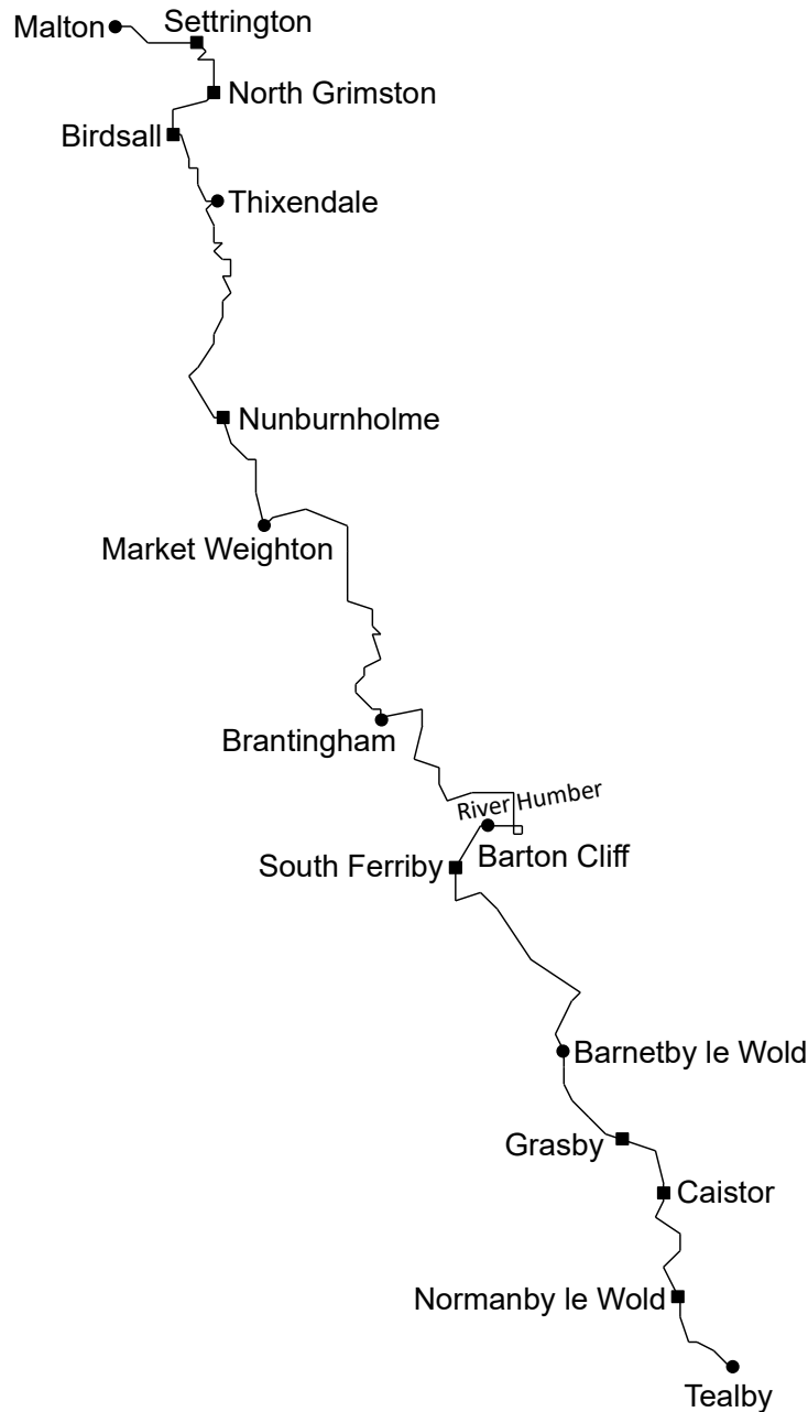
Tealby to Malton

Stage 25: Oakham to Whitwell 5.4miles, ascent 126metres (410ft), descent 142metres (460ft). Explorer 234 (Rutland Water); Landranger 141 (Kettering).